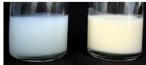
Left: A sample of "foremilk" with higher water content which the infant sucks at the beginning of the feeding, Right: A sample of "hindmilk" with higher content of nutrients which the infant sucks at the end from almost empty breast.

Composition of the breast milk is tuned to the needs of the newborn. During the first days after birth, colostrum (the “first milk”) is produced which is rich in immunoglobulins and has lower content of lactose. After few days, it changes onto mature milk. Calorific value of breast milk is around 67kcal/100ml. [3] The composition of breast milk – saccharides: 10g/100ml, fats: 5-7g/100ml, proteins: 1,5g/100ml [10]