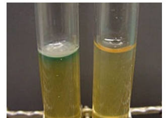
Pyocyanin production on soft agar. Right tube uninoculated, serving as a control.