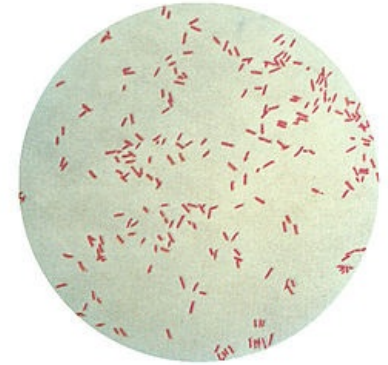
Pseudomonas aeruginosa gram staining