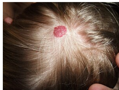
Hemangioma on the hairy part of the head.

Hemangiomas can develop at any time during the first months of life. They are present in 10% of children at one year of age. Children's hemangiomas tend to disappear - 50% disappear within 5 years of age, 90% within 10 years of age. Atrophy, telangiectasia, hypopigmentation or scar may subsequently develop at the site of the hemangioma. Multiple skin hemangiomas may be accompanied by hemangiomas of the liver and gastrointestinal tract with a risk of obstruction or bleeding. Rarely, large and multiple hemangiomas lead to heart failure due to high cardiac output. [1]