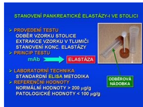
Stanovení pankreatické elastázy-I ve stolici