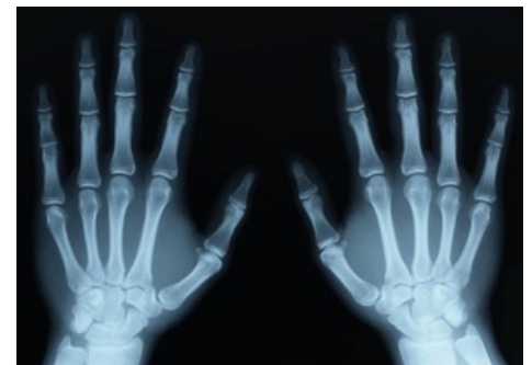
Figure 17 - X-ray image of human hands.