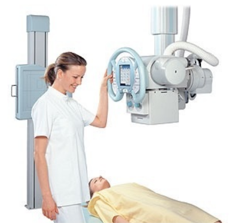
Figure 18 - medical X-ray device.