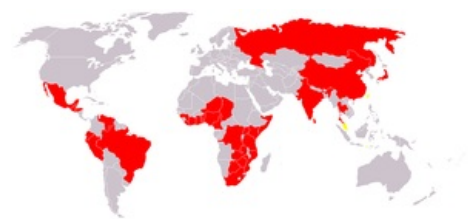
Distribution of the cholera, yellow is sporadic.

Cholera is an acute infectious disease caused by Vibrio cholerae bacteria which is endemic and epidemic in Asia. This bacteria has two biotypes, classic and El Tor. The latter has longer survival ability in nature and can cause sub-clinical cases. Its mode of transmission is by consumption of contaminated water and food, but rarely person to person spread has been reported. Undercooked or raw seafood has frequently been a source of cholera in some countries. Most infected people with V. cholerae tend to have mild-to-moderate symptoms which are diarrhoea and vomiting. However, if left untreated, cholera can be one of the most rapidly fatal infectious illnesses known. In endemic areas the incidence of cholera is highest in children.