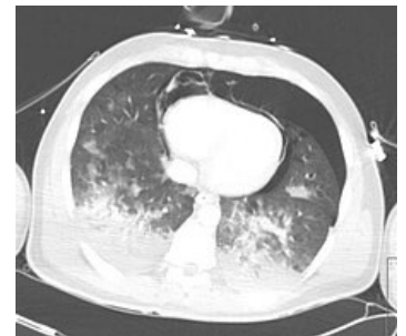
Transverse CT scan after chest contusion. Pneumothorax, hemothorax, pneumomediastinum, pneumopericardium.