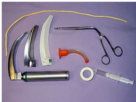
Equipment for intubation, hose on top, air duct in the middle

If intubation is expected to be difficult we can perform elective fiberoptic intubation while conscious , or if the expected risk is lower, we can primarily prepare a video laryngoscope or other aids.