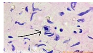
Mast cell under the microscope

Mast cells (or mast cells or heparinocytes) are mainly located in connective tissue or along blood capillaries. They are similar to basophilic granulocytes – they have granules with heparin (hence heparinocytes) and histamine in their cytoplasm and receptors for IgE on their surface. They are used in allergic reactions and inflammatory processes.