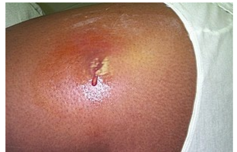
Skin abscess caused by Methicillin-resistant Staphylococcus aureus (MRSA)