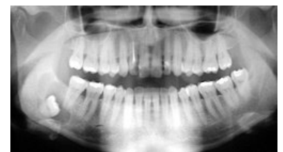
Unsectioned right lower third molar (OPG image)

Due to the lack of space in the lower jaw, or also the inclination of the tooth germ, the eruption of the lower wisdom tooth very often causes a difficulty referred to as dentitio difficilis.