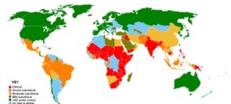
Vitamin A deficiency (WHO 1995)