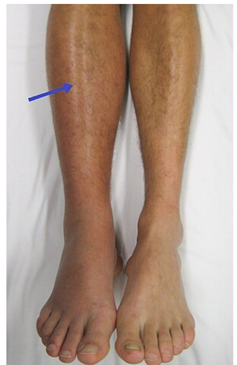
Lower limb edema.