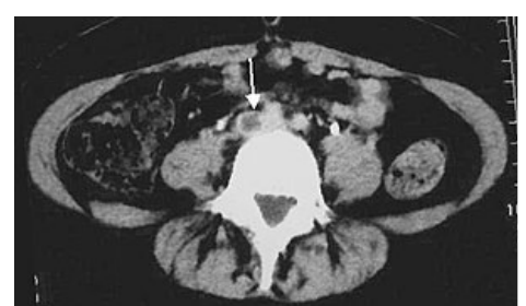
CT, thrombus of iliac right vein.